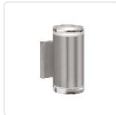
601432BN-LED Brushed Nickel