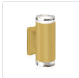
601432BG-LED Brushed Gold