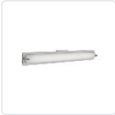
601001BN-LED Brushed Nickel