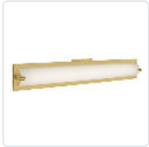
601001BG-LED Brushed Gold

Single lamp vanity with white opal glass cylinder and frosted side covers, metal details available in black, brushed gold, brushed nickel or chrome finish. Equipped with our powerful 120V AC LED technology. Available in three different sizes see series for full details.