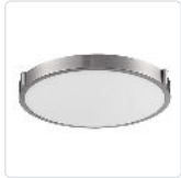
501122-LED-5CCT Brushed Nickel