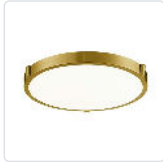
501122BG-LED-5CCT Brushed Gold