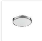
501102-LED Brushed Nickel