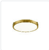
501102BG-LED Brushed Gold