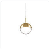
402801BG-LED Brushed Gold