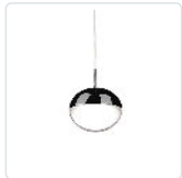
402801BC-LED Black Chrome