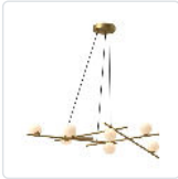
CH89854-BG/GO Brushed Gold/Glossy Opal Glass