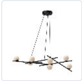
CH89854-BK/GO Black/Glossy Opal Glass