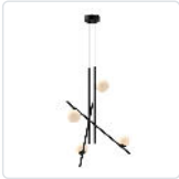
CH89832-BK/GO Black/Glossy Opal Glass