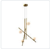
CH89832-BG/GO Brushed Gold/Glossy Opal Glass