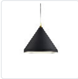
492824-BK/GD Black with Gold detail