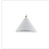
492824-WH/GD White with Gold detail