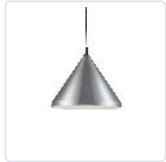
492824-BN/BK Brushed Nickel with Black detail