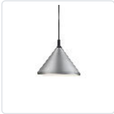
492814-BN/BK Brushed Nickel with Black detail