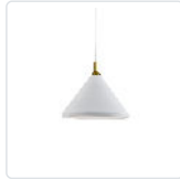
492814-WH/GD White with Gold detail