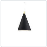
492716-BK/GD Black with Gold detail