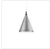
492716-BN/BK Brushed Nickel with Black detail