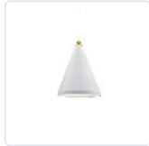
492716-WH/GD White with Gold detail