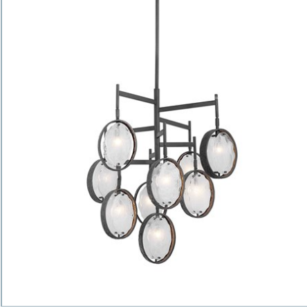
MAXIN, 9 LT CHANDELIER