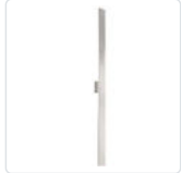
AT7972-BN Brushed Nickel