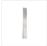
AT7924-BN Brushed Nickel

Timeless simplicity with versatile purpose is offered with this wall sconce that measures 24 inches in length. Vesta mounts horizontally or vertically from a matching aluminum square affixed in the middle of the rectangular beam of formed aluminum. The concealed LEDs illuminate the mounting plane creating pool of light on the wall. Vesta is available in three different finishes: black or white powder coating and brushed nickel.