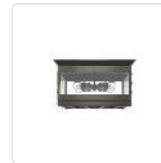
FM351004UB Urban Bronze

*For complete warranty terms, please visit: www.aloralighting.com/warranty