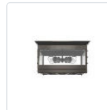
FM351004UB Urban Bronze