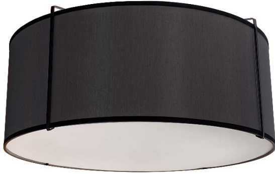
2 Light Flush Mount Drum Black Shade w/ White Fabric Diffuser