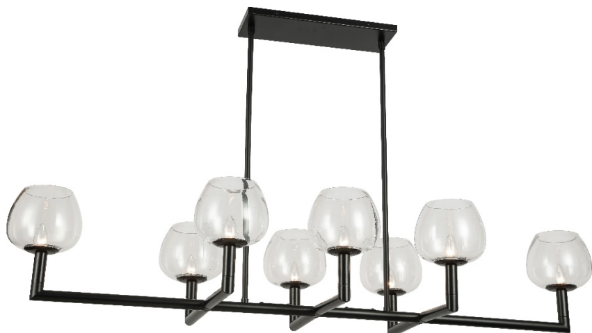
8 Light Incandescent Matte Black Horizontal Chandelier w/ Clear Glas

Height 9.75 Width/Length 51.25 Depth 19.25 Weight 8