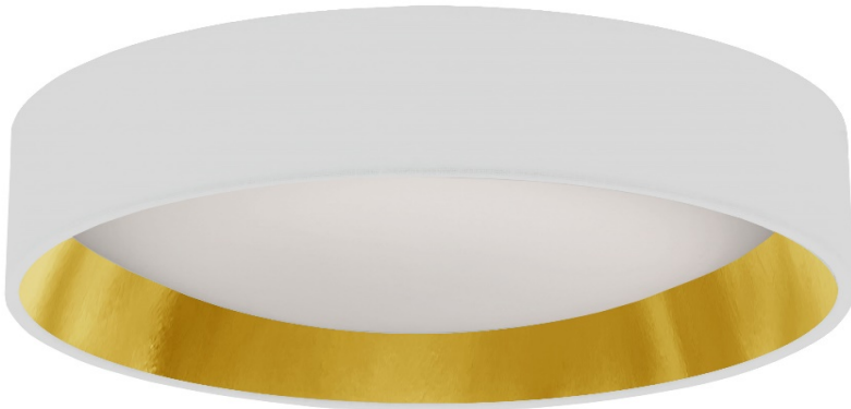
15" Light Flush Mount Fixture White/Gold Shade

Height 3 Width/Length 15 Depth 15 Weight 3