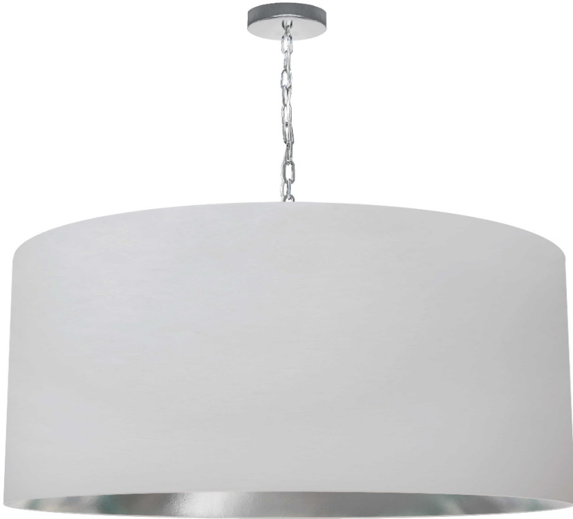
1 Light X-Large Braxton Polished Chrome Pendant w/ White/Silver Shade