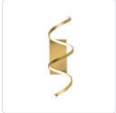
WS93724-AN Antique Brass

A looping radiant line casts light across space in a continuous helical path. The Synergy series is characterized by the rolled rectangular extrusion, which emits soft light through the silicon opal lens. Configured in both linear and ring arrangements, the arcing aluminum allows the curated finishes to be visible at every angle.