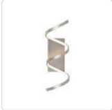
WS93724-AS Antique Silver