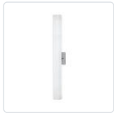
WS8432-BN Brushed Nickel