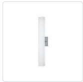
WS8424-BN Brushed Nickel