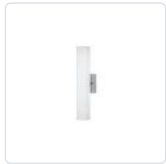
WS8418-BN Brushed Nickel