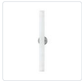
WS8332-BN Brushed Nickel