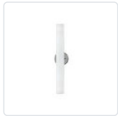
WS8324-BN Brushed Nickel