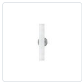
WS8318-BN Brushed Nickel