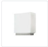
WS3909-BN Brushed Nickel