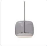
PD70610-SM/BN Smoked/Brushed Nickel