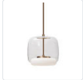
PD70610-CL/VB Clear/Vintage Brass