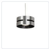
PD6705-BN Brushed Nickel

Single LED pendant with heavy gauged cast aluminum outer casting, visible black heatsink from two decorative openings around the outer casing and from the bottom of the pendant. 45 degree integrated reflector. Available metal finishes in brushed nickel white and black. 120V AC LED technology,