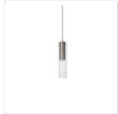
PD21703-BN Brushed Nickel