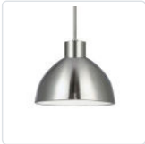
PD1709-BN Brushed Nickel