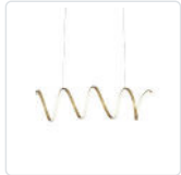
LP93742-AN Antique Brass

A looping radiant line casts light across space in a continuous helical path. The Synergy series is characterized by the rolled rectangular extrusion, which emits soft light through the silicon opal lens. Configured in both linear and ring arrangements, the arcing aluminum allows the curated finishes to be visible at every angle.