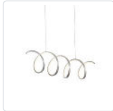
LP93742-AS Antique Silver