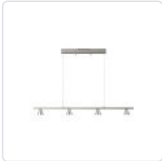
LP19937-BN Brushed Nickel