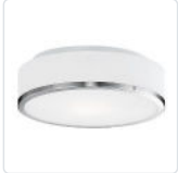
FM6012-BN Brushed Nickel