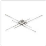
FM18247-BN Brushed Nickel