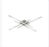
FM18232-BN Brushed Nickel

Following the success of the Vega family is the next evolution of the line, Vega Minor. The diminutive square linear profile envelops and radiates a soft uniform light in a diverse spectrum of lengths and unique configurations. Refined details with crafted finishes augment the reductive silhouette of the expanded collection.