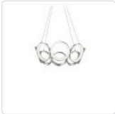
CH94824-AS Antique Silver