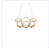
CH94824-AN Antique Brass

Die-cast aluminum rings with translucent acrylic diffusers. Metallic brushed or matte powder-coat finish. Outward emitting light. Custom options available.