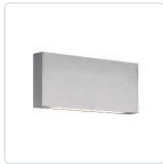
AT6610-BN Brushed Nickel