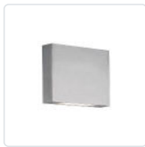
AT6606-BN Brushed Nickel