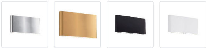
AT6510-BN Brushed Nickel AT6510-GD Gold AT6510-BK Black AT6510-WH White

This All-terior minimalist sleek cast aluminum wall sconce is a beautiful addition to any indoor or outdoor room. Finished with a high end brushed nickel or powder coated white cast aluminum, rectangular in size with smooth sleek rounded corners. Installed at the top and bottom of the fixture is our powerful 120V AC LED technology, covered by premium frosted optical lenses which omits the light from the fixture evenly against the wall. Available in two different styles and sizes view series for full family details.