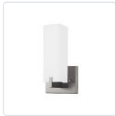
601485BN-LED Brushed Nickel