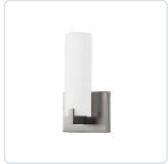
601484BN-LED Brushed Nickel