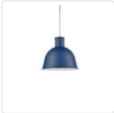
493516-IB Indigo Blue