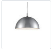
492332-BN/BK Brushed Nickel with Black detail

Single-lamp pendant with aluminum dome shade showcasing powder-coated or plated finishes with metal details and a matte white interior. Exterior shade colors are black, brushed nickel, or white. Suspended by cloth cable. Available in three sizes.