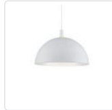
492332-WH/GD White with Gold detail