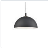
492332-BK/GD Black with Gold detail