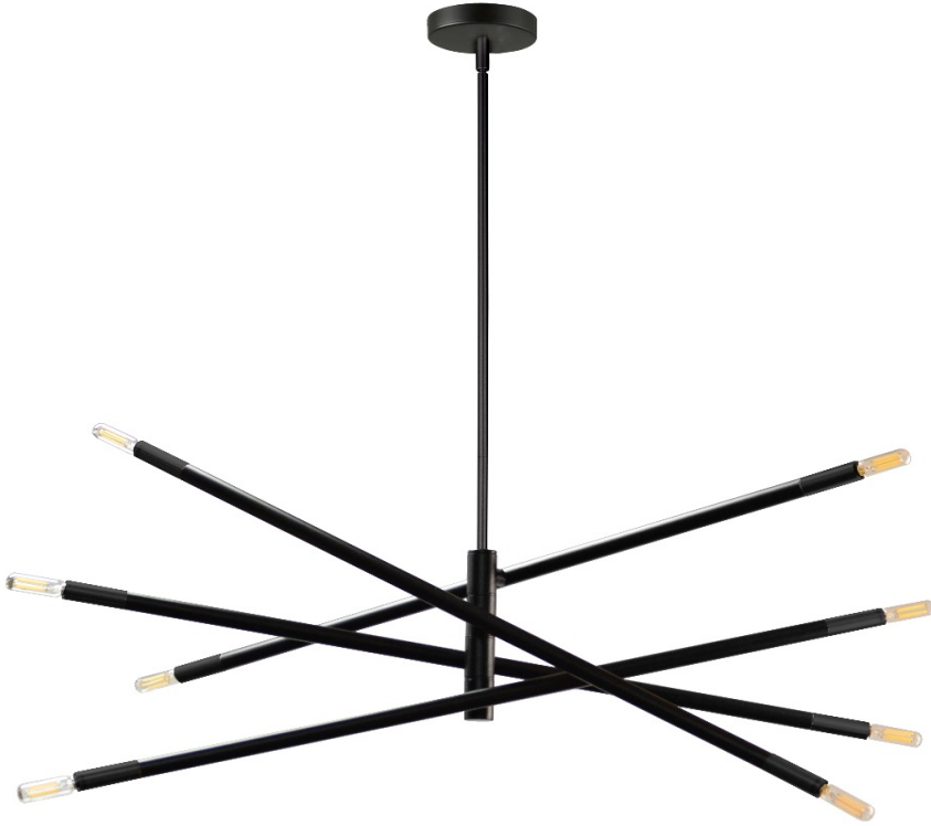
8 Light Incandescent Pendant, Matte Black

Height 8 Width/Length 35.5 Depth 35.5 Weight 6.9