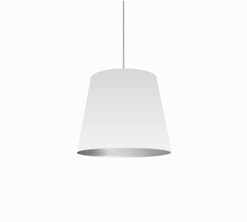
1 Light Tapered Drum Pendant with White on Silver Shade

Height 20 Width/Length 20 Depth 20 Weight 6