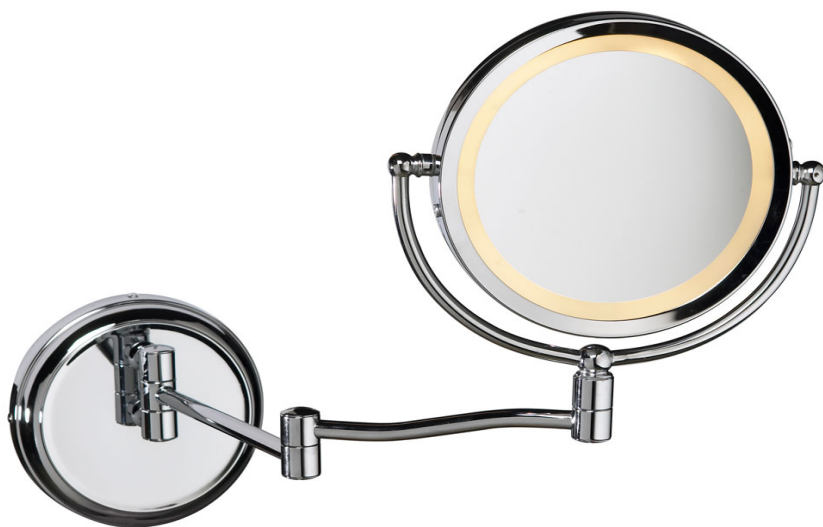
Swing Arm LED Lighted Magnifier Mirror, Polished Chrome

Height 7.5 Width/Length 7.5 Depth 3 Weight 4