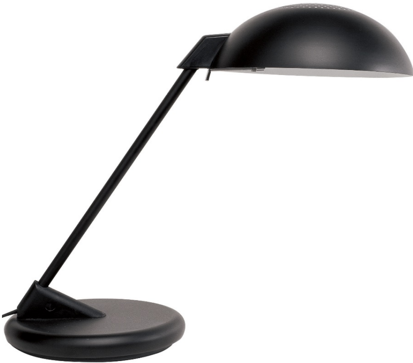
Desk Lamp, Matte Black