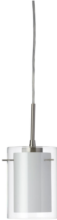
Single Pendant, Chrome, Clear/White Glass